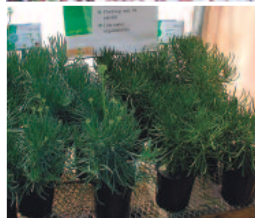
Top to bottom: geranium 'Indian Dunes'; euphorbia 'Diamond Frost'; torenia 'Summer Wave Lavender Blue'; cordyline 'Red Star'; senecio 'Kilimanjaro' and 'Himalaya'.