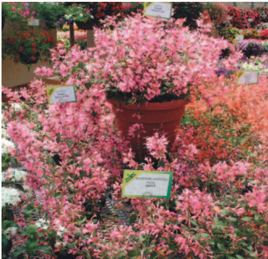
Top to bottom: Barcelona series lavender; agastache 'Acapulco Salmon & Pink'; opposite, top to bottom: impatiens 'Fusion Sunset'; plectranthus 'Silver Shield'.

We are continuing with the Pack Trials coverage from last month, and there are some new and "second servings" releases I wanted to highlight in this issue. Most of these plants are quite unique, but as a group I think they offer some really great potential for high-quality mixed containers and upper-end color due to either their flower or foliage qualities.